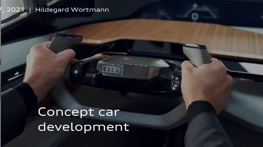
Concept car development