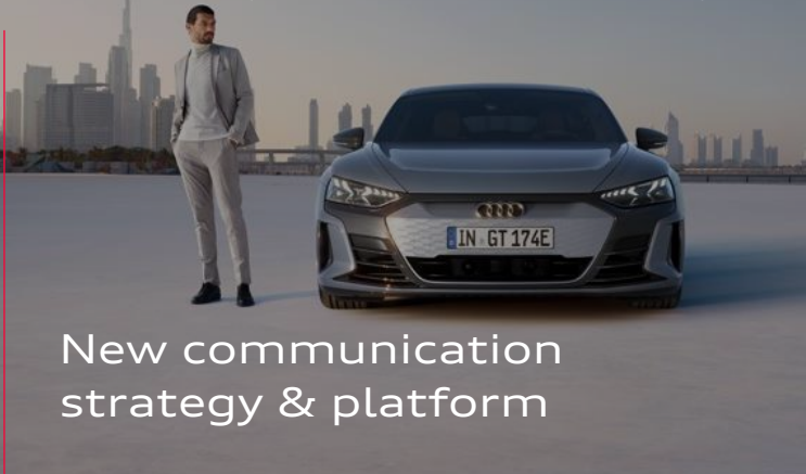
New communication strategy & platform