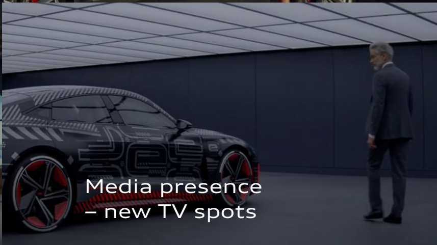
Media presence – new TV spots