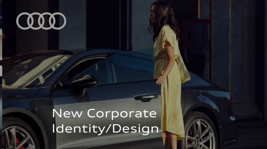
New Corporate Identity/Design