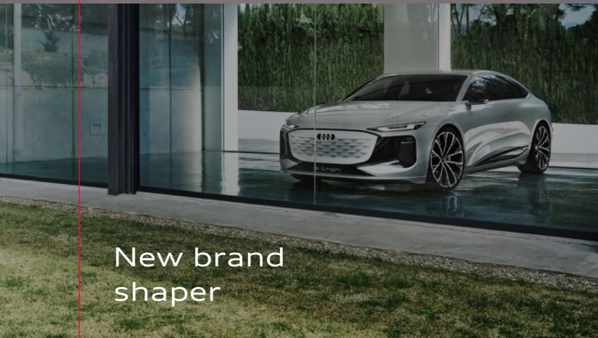
New brand shaper